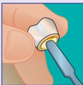
STEP 8: Place a thin, even coat of cement on inner surface of restoration. Do not use the mixture if it has lost its gloss.