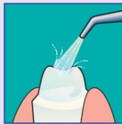
STEP 2: Thoroughly clean preparation with water.