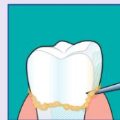
STEP 10: Allow cement to set, then remove excess.