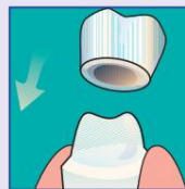
STEP 9: Seat the restoration without pressure.