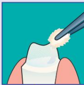
STEP 3: Gently dry preparation. Do not over dry.