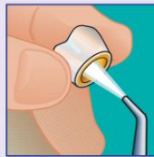
STEP 4: Dry the restoration with air.