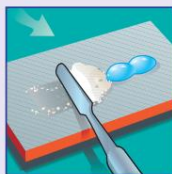
STEP 7: Mix powder and liquid.