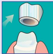
STEP 1: Remove provisional restoration.